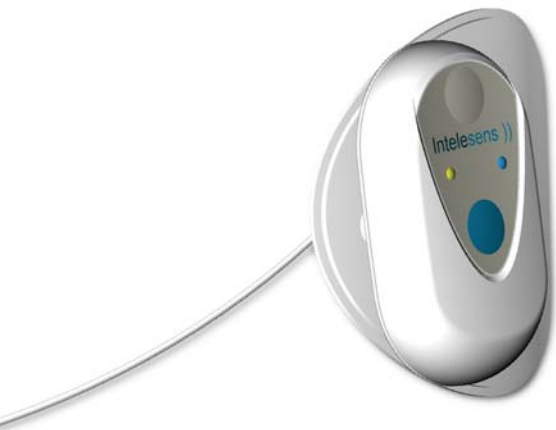
< AINGEAL PRODUCT USING THE VITALSENS PLATFORM

Intelesens has developed a flexible wireless vital signs platform, vitalsens , which can be customised to provide a range of monitoring products for in-hospital use and deployment at-home or on-the-move.